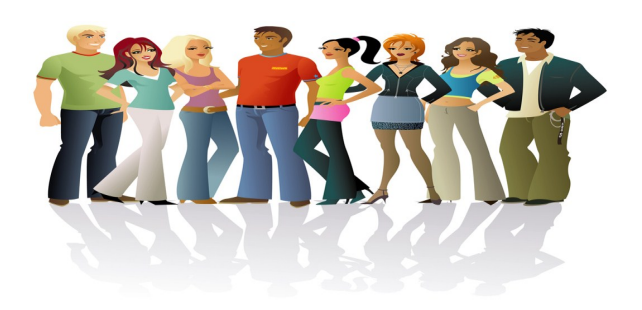
Please join us here every Sunday morning at 9:45 a.m.!

Confirm not Conform (or CnC) is a confirmation program that gives youth a voice and a choice -- but it is so much more. It is a congregational development program , involving parents, adult mentors, and church leadership and connecting them with youth and their ministry. It empowers youth for ministry, involving them in the life of the congregation and encouraging adults to see them as full and active members, not merely youth to be ministered to. It offers a channel that allows youth to speak to the church so that the church may learn from what youth have to offer. And it offers youth an opportunity to ask their questions and voice their doubts -- something adults may have never been allowed to do during their own confirmation. Youth who are already confirmed will be working in a ministry intern program designed by our HS Sunday morning leaders. They will explore lay ministry opportunities here at Emmanuel, in the Diocese and in the world along with learning more